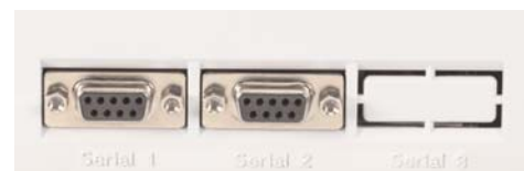
Two Standard RS-232C Ports