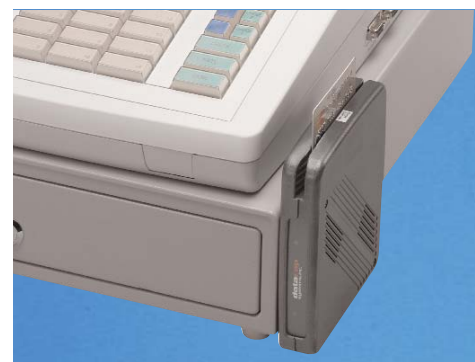
DataTran™ Integrated Credit Option