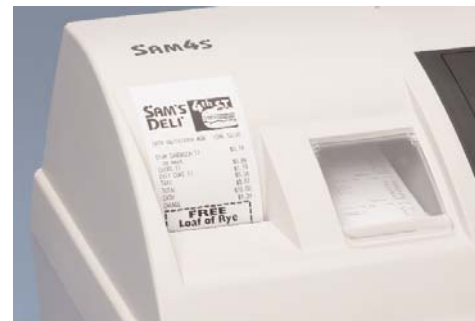
Quick and Easy Drop and Print Paper Loading